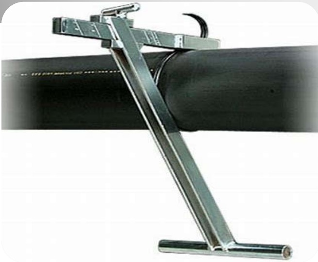
EXTERIOR BEAD REMOVAL