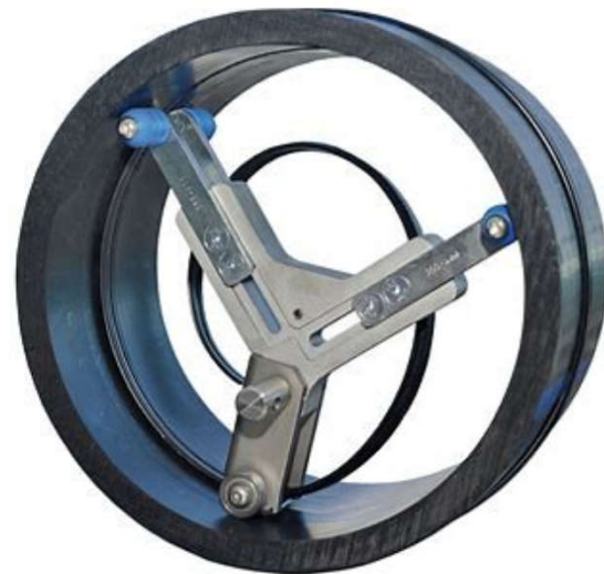
INTERIOR BEAD REMOVAL